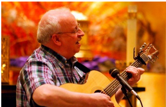
David Haas, Composer of songs such as: